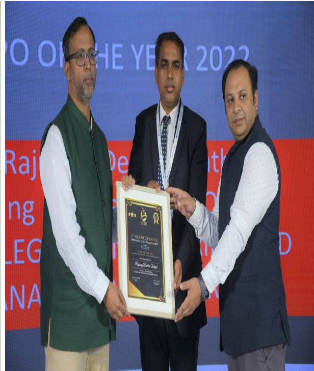
TPO of the year 2022 on 27 th Aug. 2022 at New Delhi