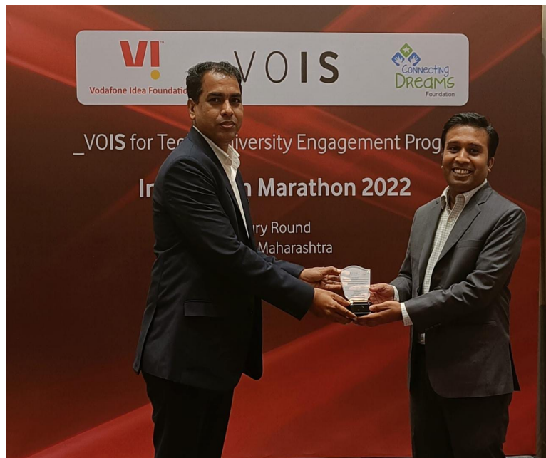
Award for Valuable contribution towards enabling the future workforce become technically empowered and industry ready by Vodafone Idea Foundation