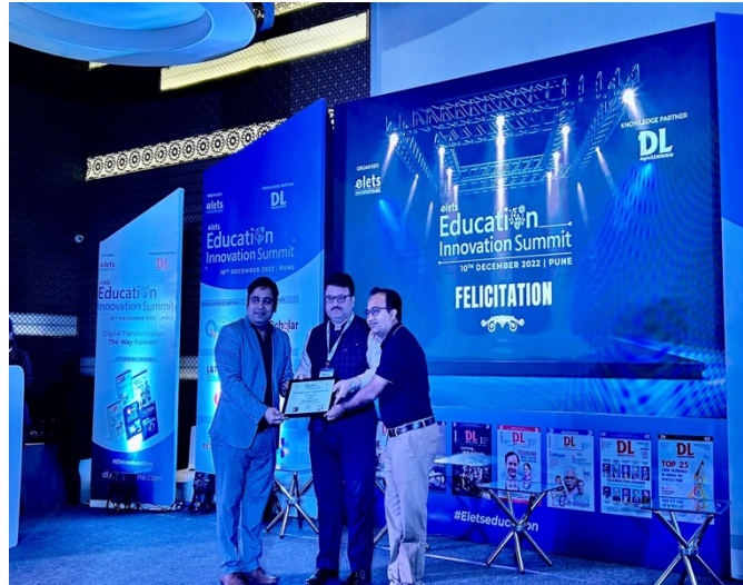
“Outstanding Leader in Higher Education” in Education Innovation Summit on 10 th Dec. 2022.