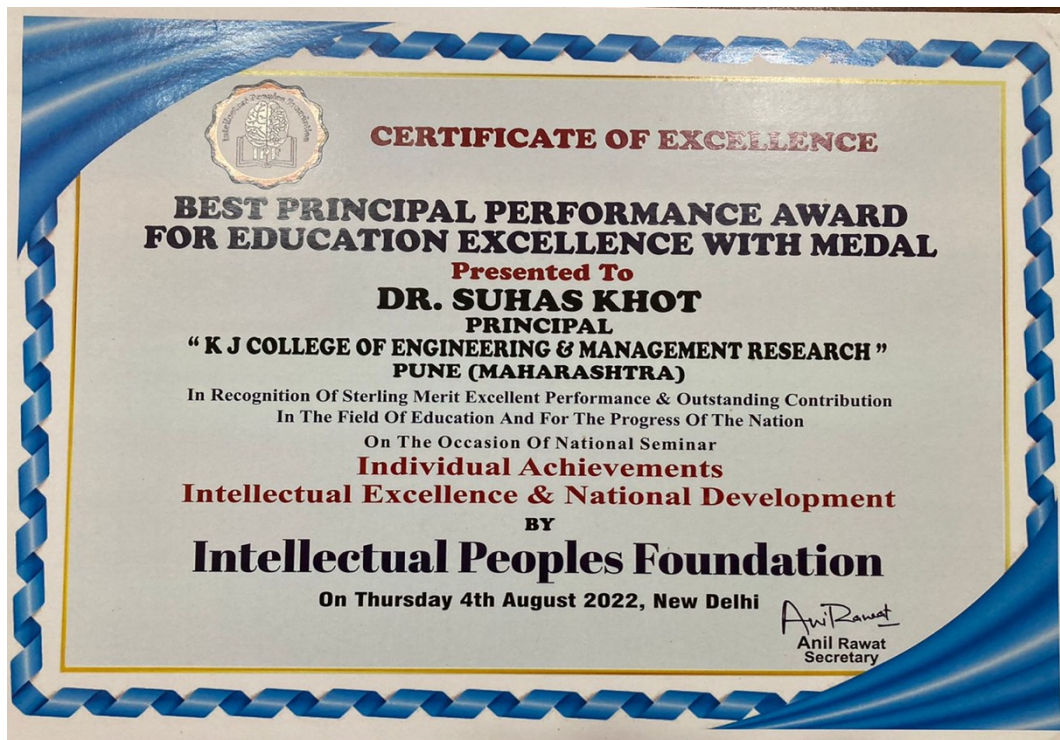
“Best Principal Performance Award” in recognition of sterling merit excellent performance & outstanding contribution in the field of education and for progress of the nation by Intellectual Peoples Foundation on 4 th Aug. 2022, New Delhi